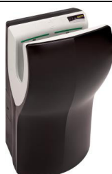
M14AB Black finish