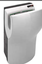
M14ACS Satin finish