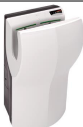
M14A White finish